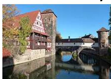
Henkersteg