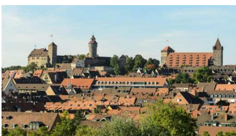
View of Nuremberg